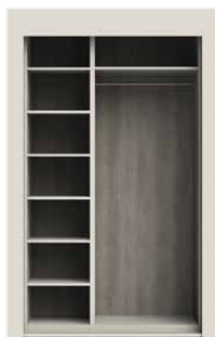
1450mm opening width