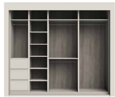
2750mm opening width