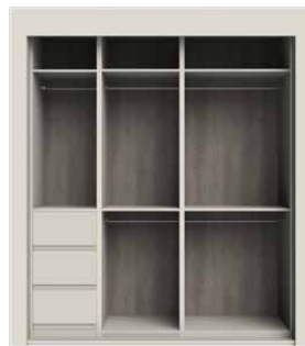
2050mm opening width