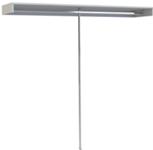
Top shelf and hanger bar.