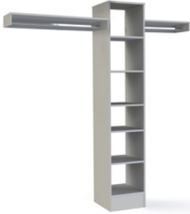
Tower unit with shelves, a top shelf and hanger bars. Available in 400 & 600mm tower units.