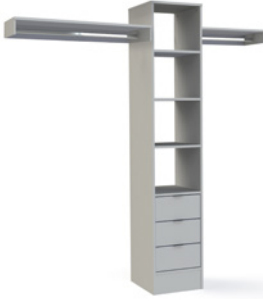
Tower unit with shelves, 3 drawers, a top shelf and hanger bars. Available in 400 & 600mm tower units.