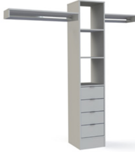
Tower unit with shelves, 4 drawers, a top shelf and hanger bars. Available in 400 & 600mm tower units.