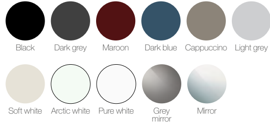
Black Dark grey Maroon Dark blue Cappuccino Light grey Soft white Arctic white Pure white Grey mirror Mirror