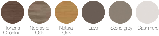
Tortona Chestnut Nebraska Oak Natural Oak Lava Stone grey Cashmere