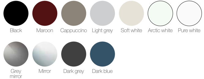
Black Maroon Cappuccino Light grey Soft white Arctic white Pure white Grey mirror Mirror Dark grey Dark blue